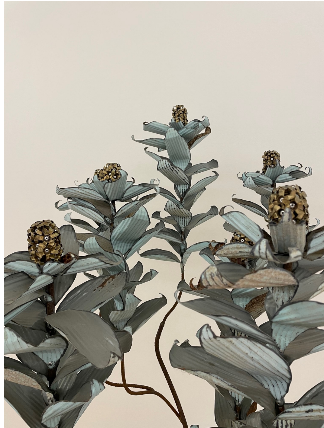
Right: Samuel Mulcahy, Tetnesteii glans acinium lacuna (detail), 2022, steel, brass, aluminium, 160 x 80 x 74cm.