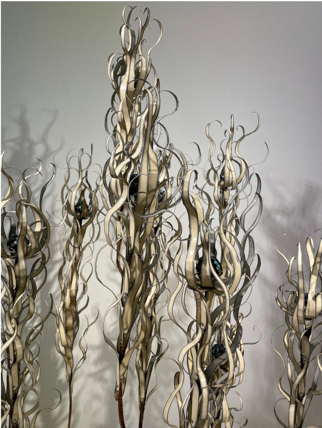
Above: Samuel Mulcahy, Tetnesteii glans acinum tectum (detail), 2022, steel, brass, aluminium, 177 x 85 x 73cm.