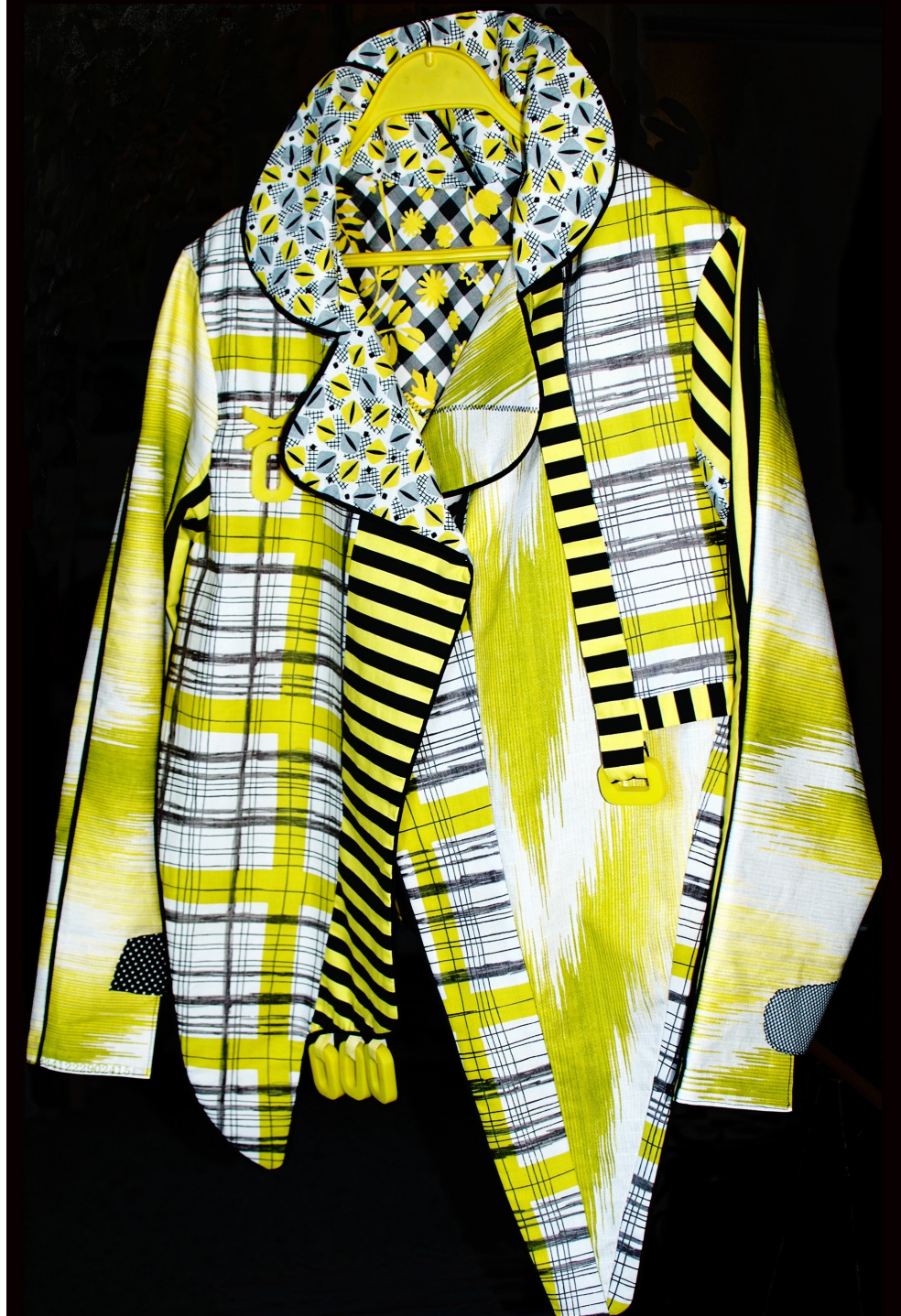
Above: Annabelle Collett, XO jacket , 2017, mixed fabrics, found plastics and hanger, buttons, 100 x 74(approx) cm . Right: Annabelle Collett, Measure , 2013, assorted found plastics on canvas , 70 x 50x 7.5cm . Private Collection, South Australia.